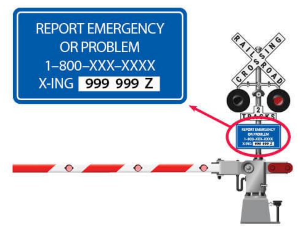
Chart 3: Emergency Notification Sign (ENS)

In May, the ORS discovered that SCDOT's Commercial Driver's License (CDL) manual instructed the driver of a vehicle that is stuck on railroad tracks to "call 911". The ORS and SCDOT worked together to revise the manual to include "look for the ENS signs" if a driver is stuck on railroad tracks and proposed a graphical depiction to be used in the manual. Chart 3 illustrates the graphic now incorporated in the SCDOT CDL training manual.